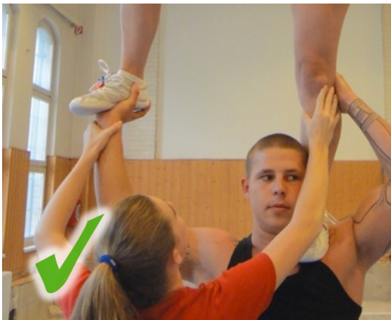
Left hand on wrist, right hand on top's leg

Spotters may not be a primary support of the pyramid. Therefore, a spotter may not have both hands under the sole of the top persons foot / feet or under the hands of the bases (because then they would be a base, not a spotter).