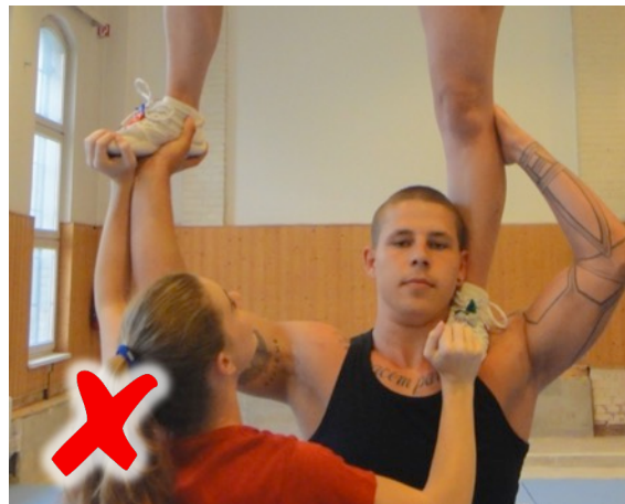
Both hands under the top's soles