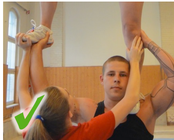
Left hand under sole, right hand on top's leg